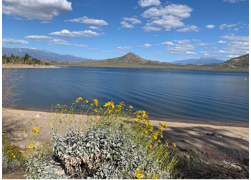
Lake Perris, March 2020

Recently – on May 1, 2020 – while the above cases were still in court, the WLC produced massive new environmental documents and was seeking new approvals on basically the same project. The city planning commission approved the project after midnight on Friday, May 15 th . EarthJustice, representing the Sierra Club and four other groups, filed an appeal on May 26, 2020, challenging the environmental findings and conclusions. The City Council is scheduled to consider the WLC Development Agreement at the June 16 th meeting and it is likely they will also consider the recently filed appeal. Please respond to the City Council with your concerns over the impacts this project will have on not only Moreno Valley but