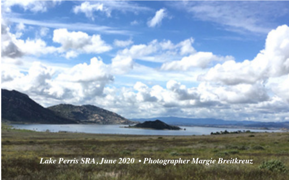
Lake Perris SRA, June 2020

and 120 loading docks on the south side of the building for diesel trucks. The Moreno Valley Group of the Sierra Club made comments on this massive warehouse which would be across the street from family homes as we have on almost every warehouse proposed in our city during the past 10 years. These lands need to be zoned for transitional uses between family homes and warehouse and warehouses with their many diesel truck trips. We will continue to follow it and make comments.